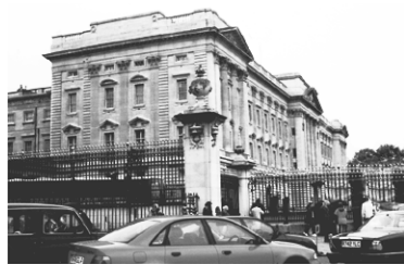
George H. W. F. Bush College.

structed in 2005 after Dubya is spanked out of office by Michael Dukakis, the 10th college continues the tradition of ever-increasing luxury, as students are each assigned their own baby grand piano and dine on gold-plated flatware in the James A. Baker III Commons. The SA holds another forum on sex in cheers.